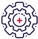
Event Strategy & Planning

We plan, manage and deliver events on any scale.